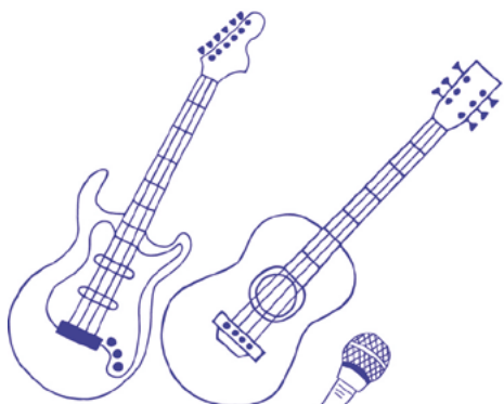
Guitar Vlad Vocals